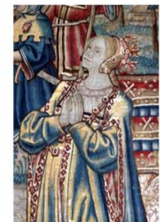
A tapestry made of silk