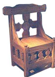
Finely carved chair