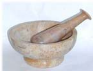
Pestle and Mortar