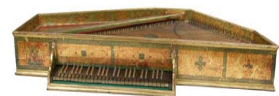
A Spinet - a type of musical instrument