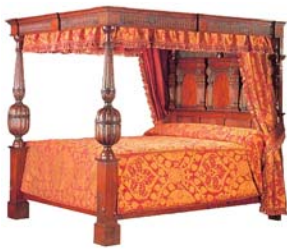
Four Poster Bed