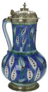
A drinking pot decorated with silver and gold