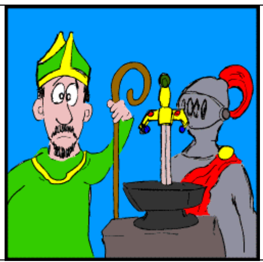
The Archbishop and Merlin called all the people to the church. A magical stone had appeared.