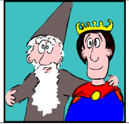
Merlin explained that Arthur was Uther's son and was the true born King of all Britain.