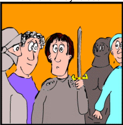
Word soon spread that Arthur had pulled the sword from the stone.