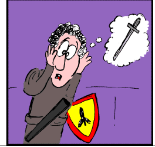
Sir Kay was in the tournament but he'd forgotten his sword!