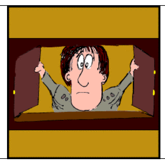
Arthur went back to get it but he couldn't find it.