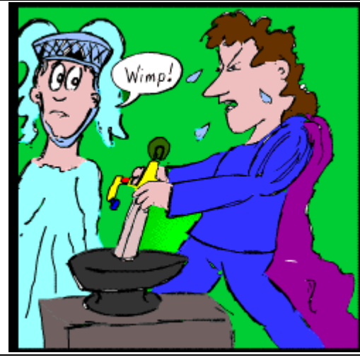
Nobody could pull the sword from the stone so they decided to have a contest to see who was strongest instead.