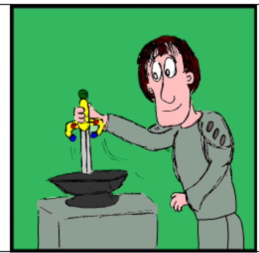
He decided to borrow the sword in the stone for Kay to use.