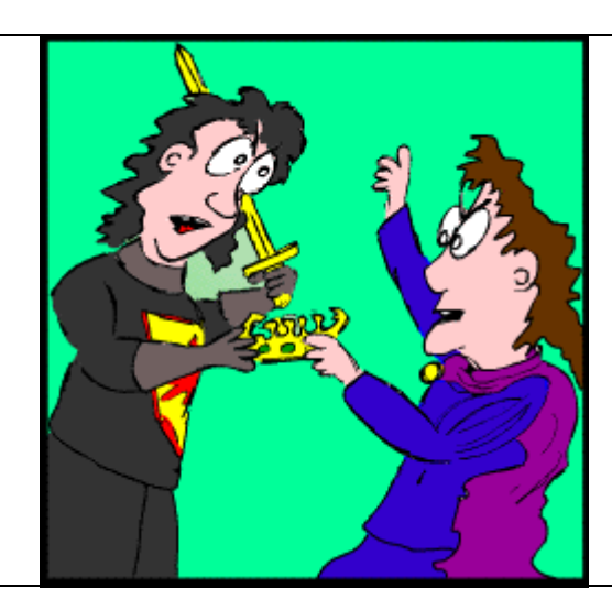
The other lords of the land fought as to who would become king.