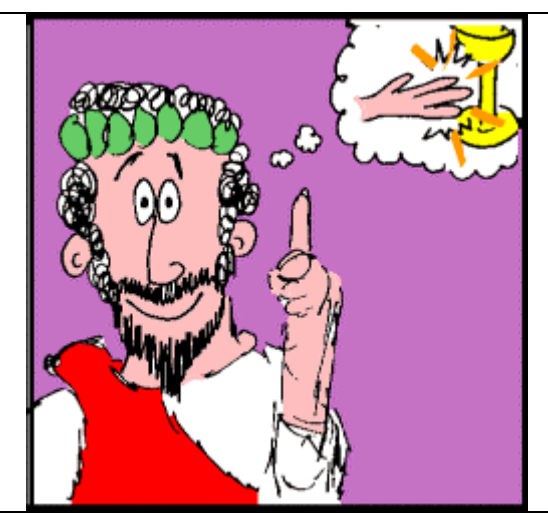
King Midas wishes that everything he touched would turn to gold. Then he would be the richest man in the world.