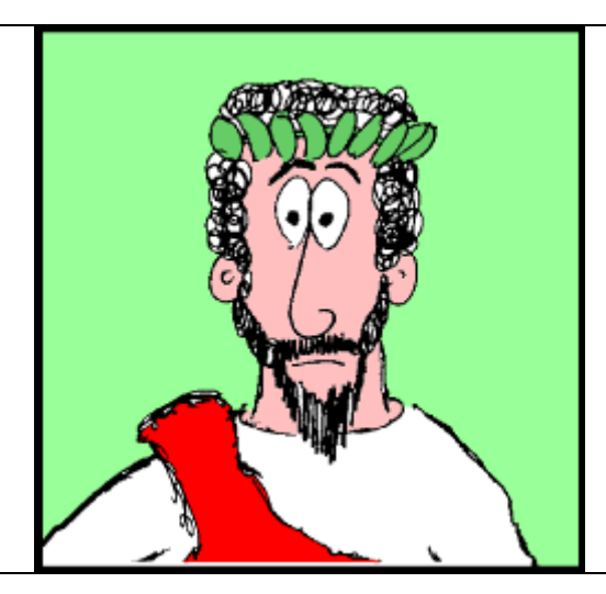
King Midas was a foolish and greedy man. He wanted to be the richest man in the world.