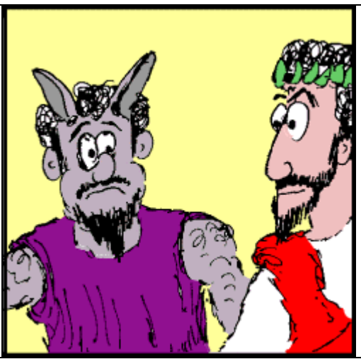
One day an old satyr came to King Midas' palace. Midas recognised him as Silenus, a friend of the god Dionysus.