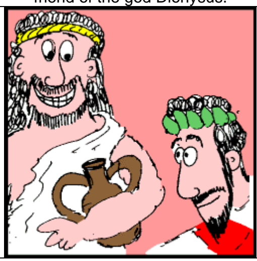
The god Dionysus was pleased Midas has helped his friend and offered to grant Midas a wish.